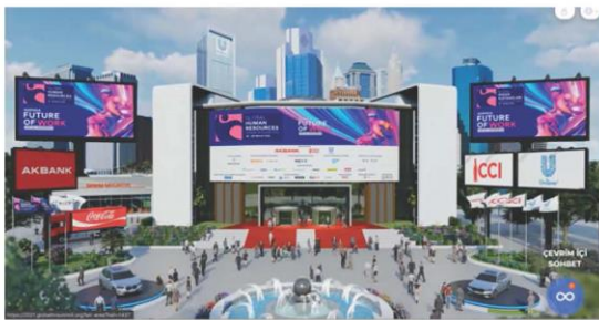
IDA 2021 main landing page with sponsor logos (example)

Please get in touch if you are interested in one of our sponsorship packages with additional pre-event, event and post-event marketing measures.