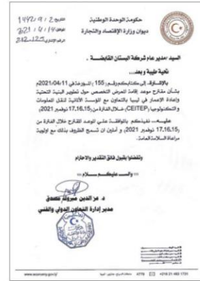
Invitation letter by the Libyan Government

ITIDA has been invited by the Libyan Government to concentrate its first online trade fair on "Reconstruct Libya". Many Libyan companies and decision makers will be obliged to visit the trade fair.