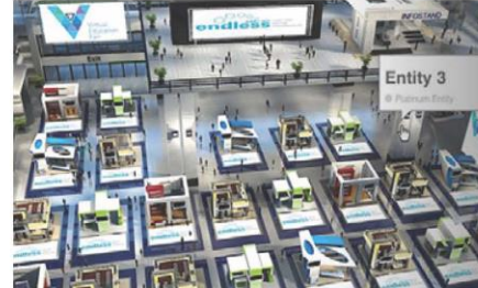
IDA 2021 Online Exhibition Hall (example)